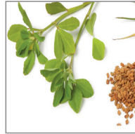
Trigonella Foenum Graecum