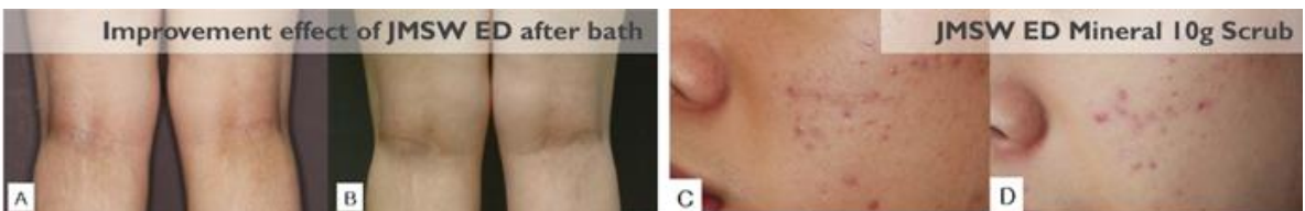
Efficacy of JMSW ED Mineral on acne